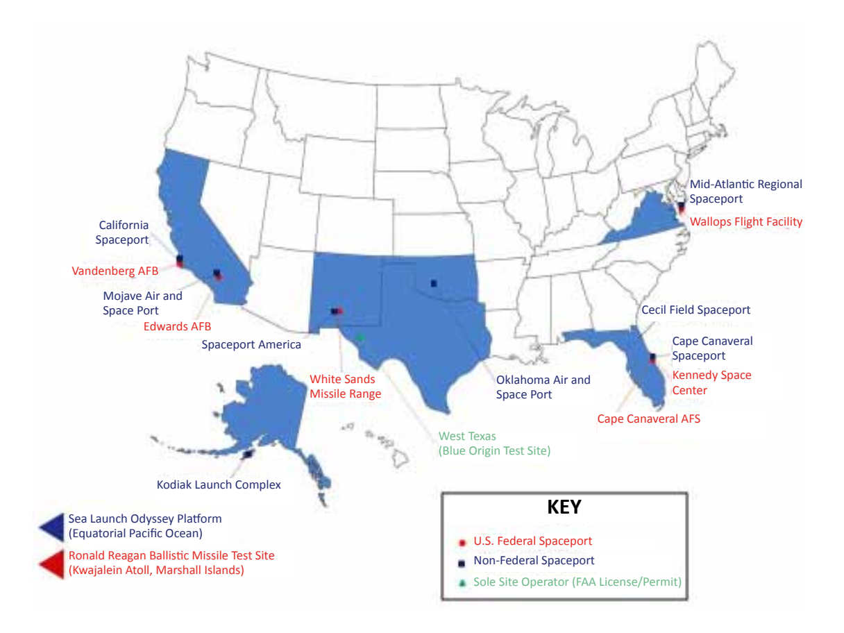
Locations of U.S. federal and FAA-licensed spaceports.