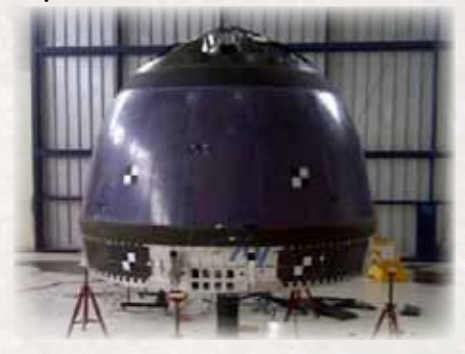
Blue Origin's Composite Crew Pressure Vessel

Blue Origin has stated that it may have opportunities for remotely controlled research aboard the New Shepard vehicle. It has selected three unmanned research experiments from Purdue University, the University of Central Florida, and Louisiana State University.