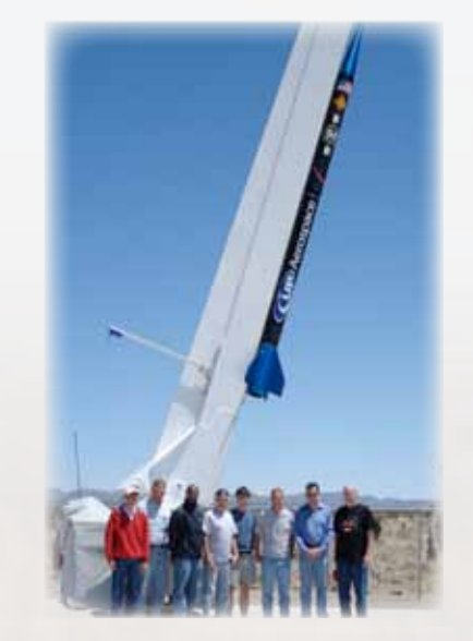
SpaceLoft launch crew the day before the first successful launch from Spaceport America on April 28, 2007.

vehicle during each flight. A payload processing facility is located adjacent to the OCC where customers can perform payload integration, setup their own telemetry system, and monitor payload functions in real time. The launch pad is located 4,500 feet east of the OCC, where a permanent concrete pad and rollback Final Assembly Building are located.